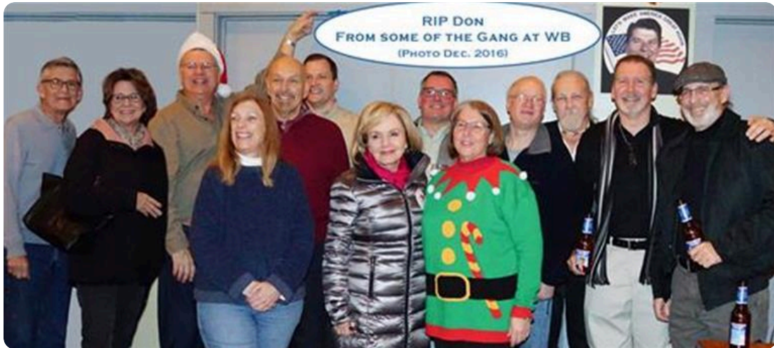
2016 WB Gang Memory